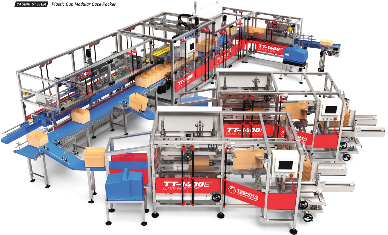
CASING SYSTEM Plastic Cup Modular Case Packer