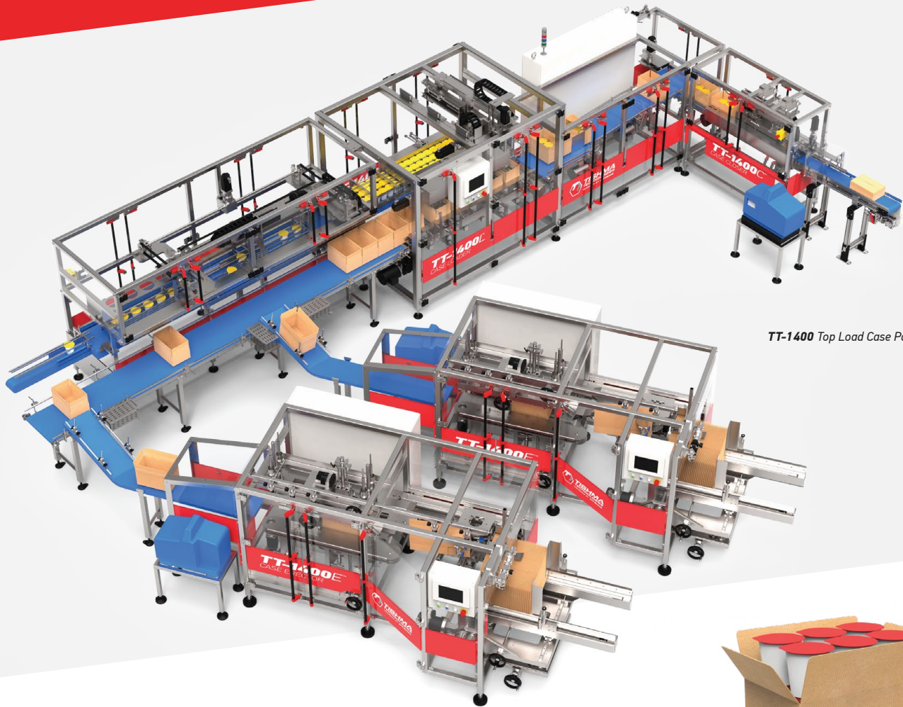
TT-1400 Top Load Case Packer