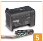
Digital pneumatics to improve throughput speed