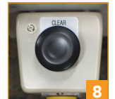
"Clear" button for jams & replacing bottom tape roll (Opposite Side of Machine)