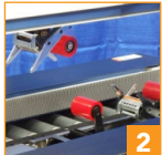
Offset tape heads process 2" high cases

*If a case lower than 6" enters the machine, the random top squeezers will retract to permit processing a case as low as 3 1/2" tall