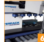
Optional top squeezers compress top major flaps