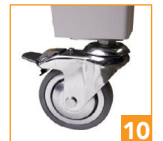
Optional swivel & locking casters