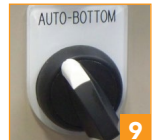
Top & bottom or bottom only seal operation modes