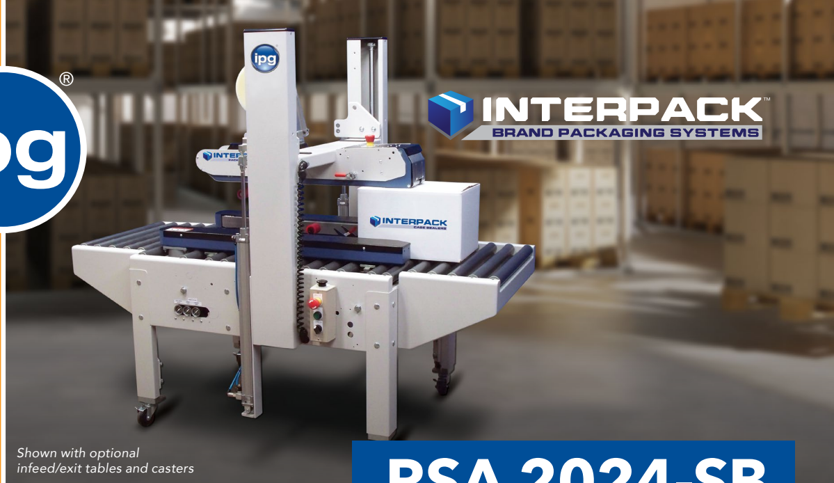
Shown with optional infeed/exit tables and casters