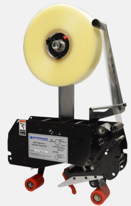
ET 2Plus tape head

When you compare features, benefits and value, Interpack Case Sealers are the right choice for operators, plant engineers, maintenance and purchasing.