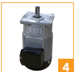
1/3 HP motors for heavy duty usage