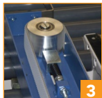
Self-tensioning & tracking side drives simplify belt replacement