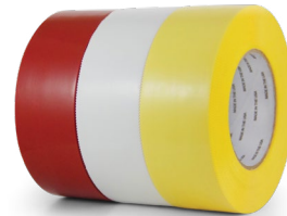
PE7 Polyethylene Tape