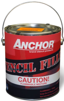
IPG/Anchor Filler #211