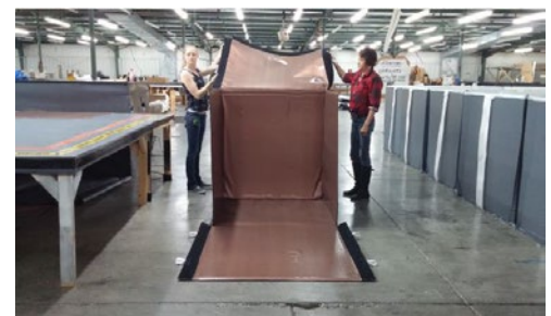
Custom CI box

Intercept® Technology is a registered trademark of Engineered Material Incorporated.