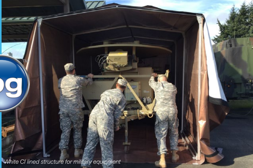
White CI lined structure for military equipment