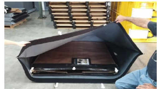
Custom NovaShield® CI outdoor storage box

* Vapor permeable coverings actually promote corrosion in humid or marine climates by allowing water vapor to pass from the ambient air through the covering, and condense onto the asset being covered.